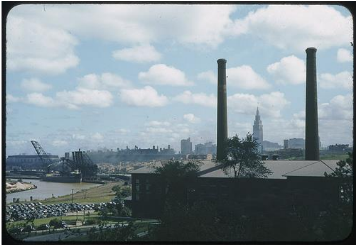
Part of the Rust Belt