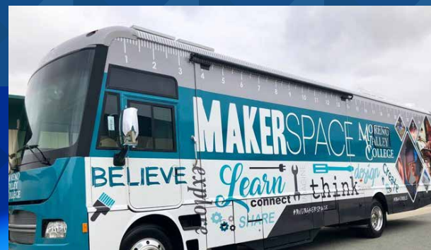
Business & Entrepreneurship