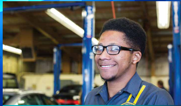
Advanced Transportation & Logistics