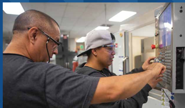
Information & Communication Technologies