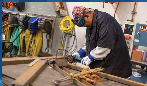
Energy, Construction, Utilities