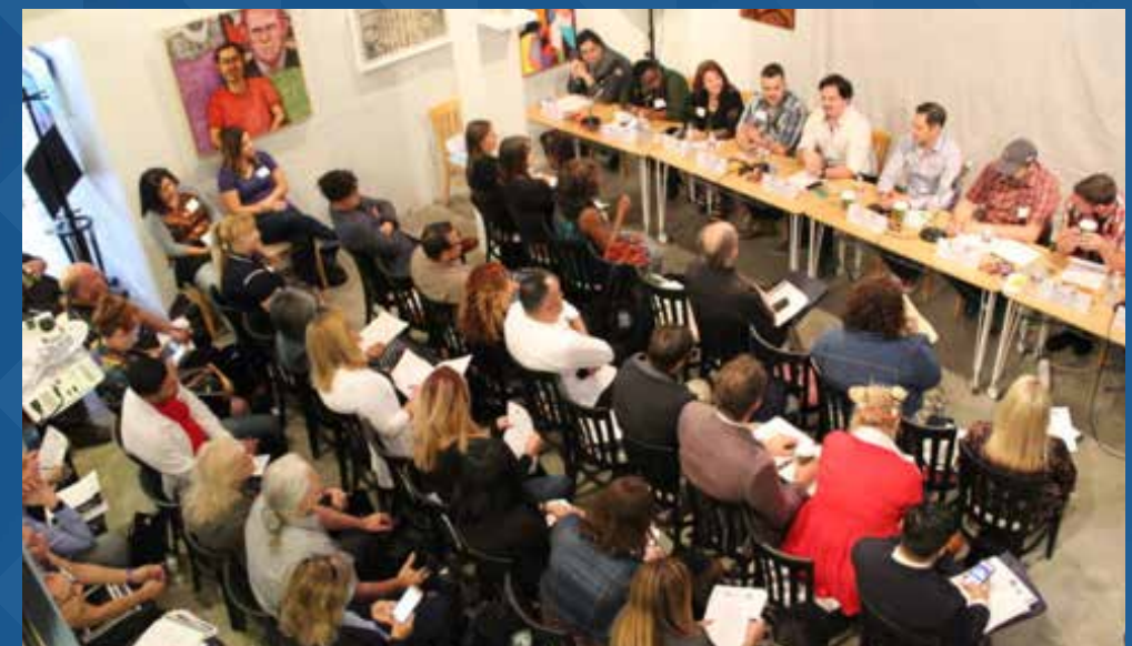
Inaugural Digital Media Advisory Community Meeting - 2017

"Education is the most powerful weapon which you can use to change the world." Nelson Mandela